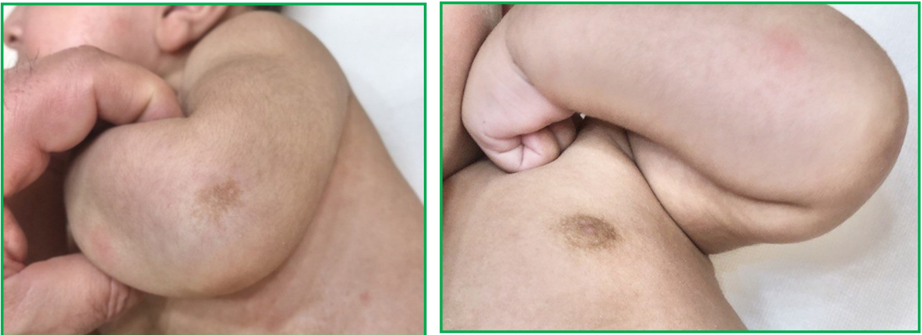
Fig. 3. Before and after scrubbing with 70% isopropyl alcohol.