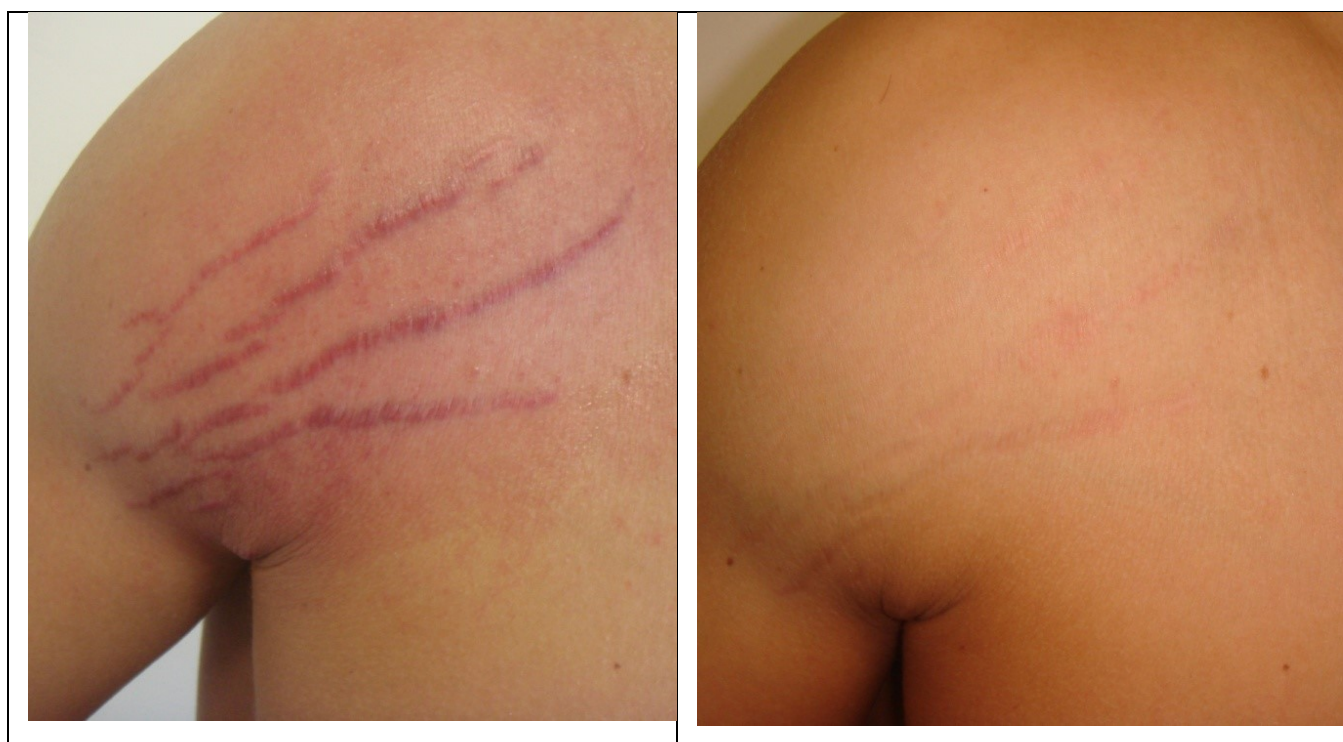
Fig. 1. A young man with striae rubrae probably due to heavy weightlifting workout. After a treatment cycle the stretch marks are less evident and now tanned in a similar way to the surrounding skin tissue.

The electromagnetic field is generated through a high-frequency electrical signal directed to a specific handpiece with an electro-conductor inside. The external part is covered with a dielectric to prevent the signal from being discharged on the patient. The dielectric, relevant and uniform outcomes have been achieved on patients with phototypes V and VI as well as tanning of the striae.