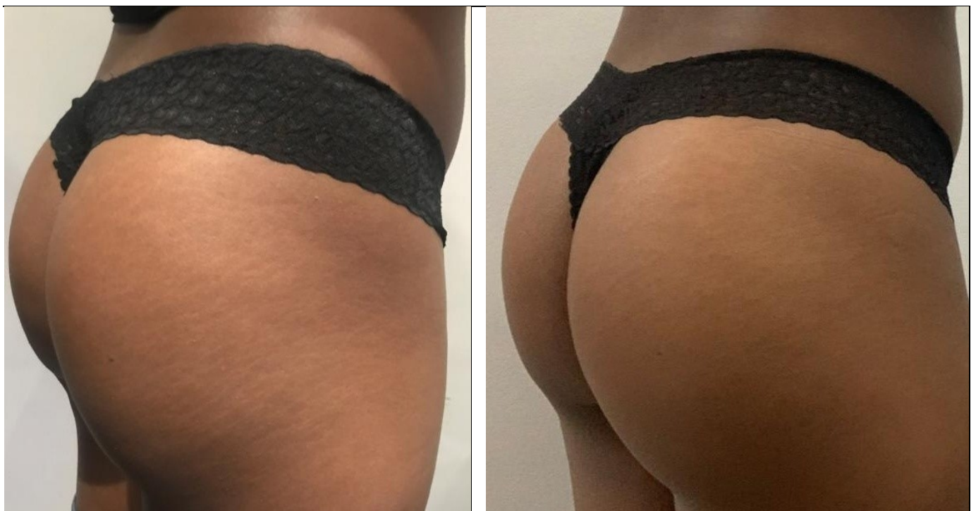
Fig. 2. A patient with skin phototype V and 18-year-old stretch marks. After a 6-session Biodermogenesi® treatment cycle the stretch marks are filled and have the same colouring as the surrounding skin.

The biopsies taken after two sessions confirm the presence of skin regeneration and show a mild but evident increase in collagen and elastic fibres.